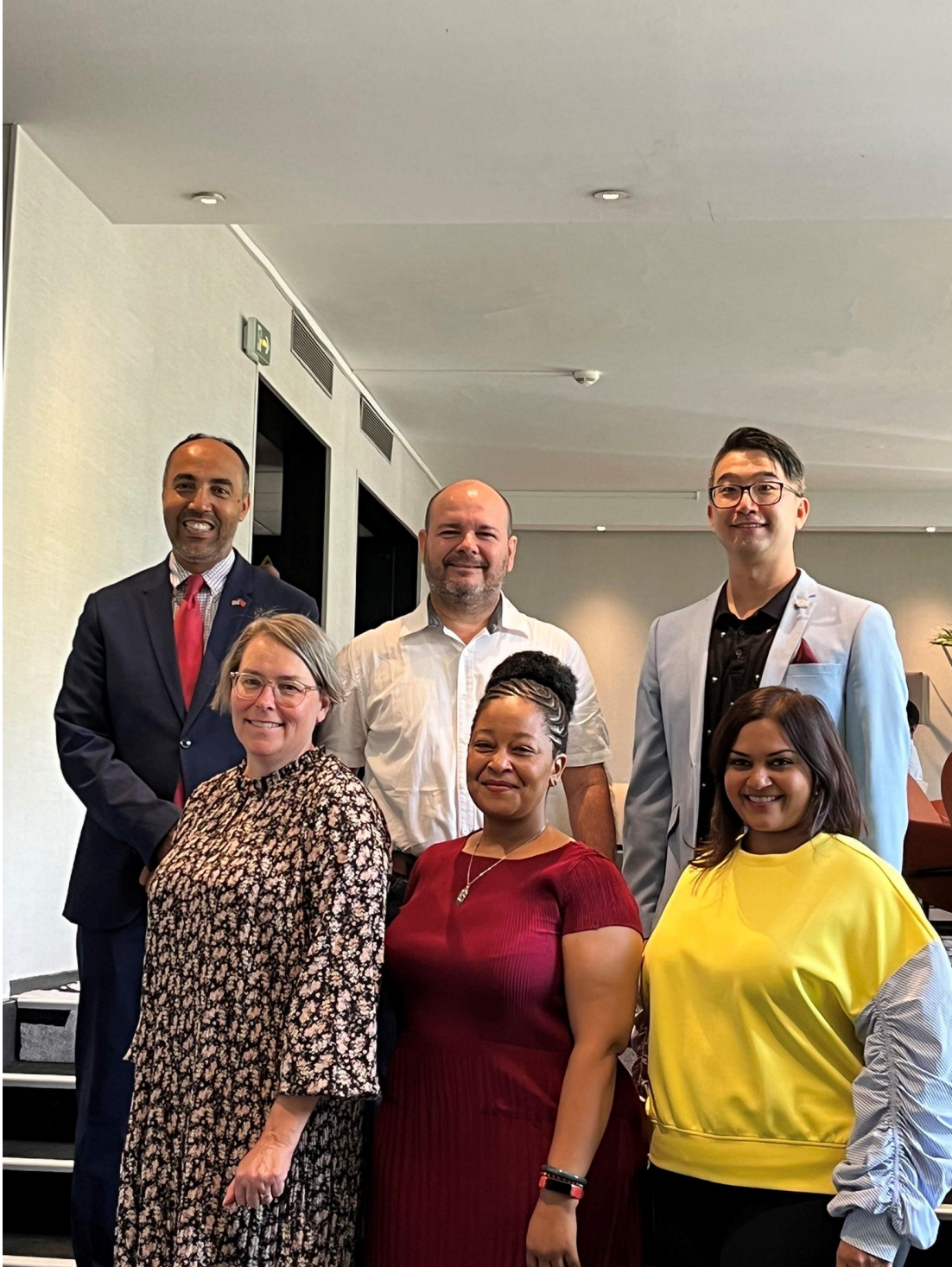
(Above: The WFOT Regional Group representatives in Paris, France, 2022)