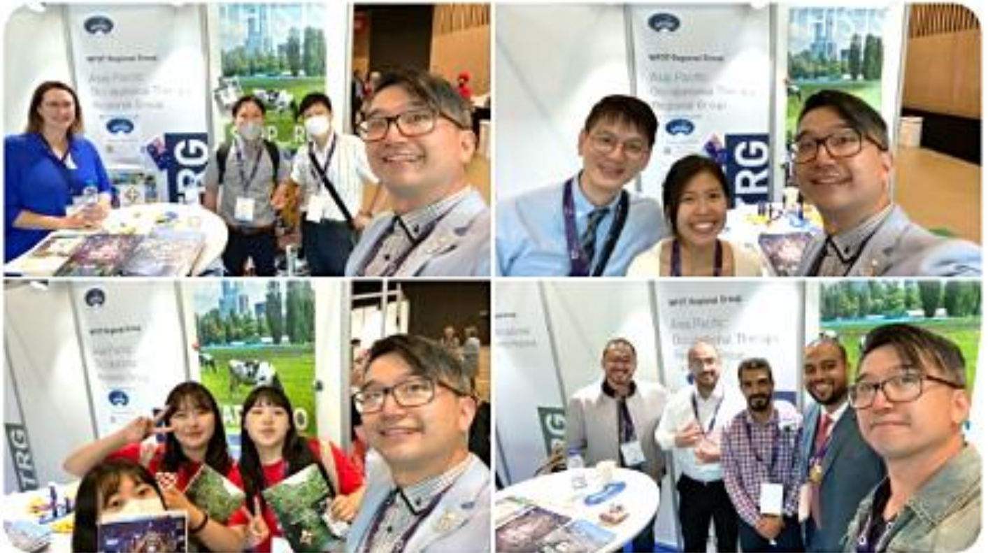
(ABOVE: Multiple Visitors at the APOTRG Stall)

The APOTRG hosted a stall at the Congress, with many members manning it throughout the proceedings and interacting with delegates from around the world. One of the biggest events being heavily promoted was the upcoming APOTRG's conference in Sapporo, Japan, 2024! There was a lot of interest and hundreds of flyers were handed out. Another popular item being handed out was the mini plush Koalas from Australia!