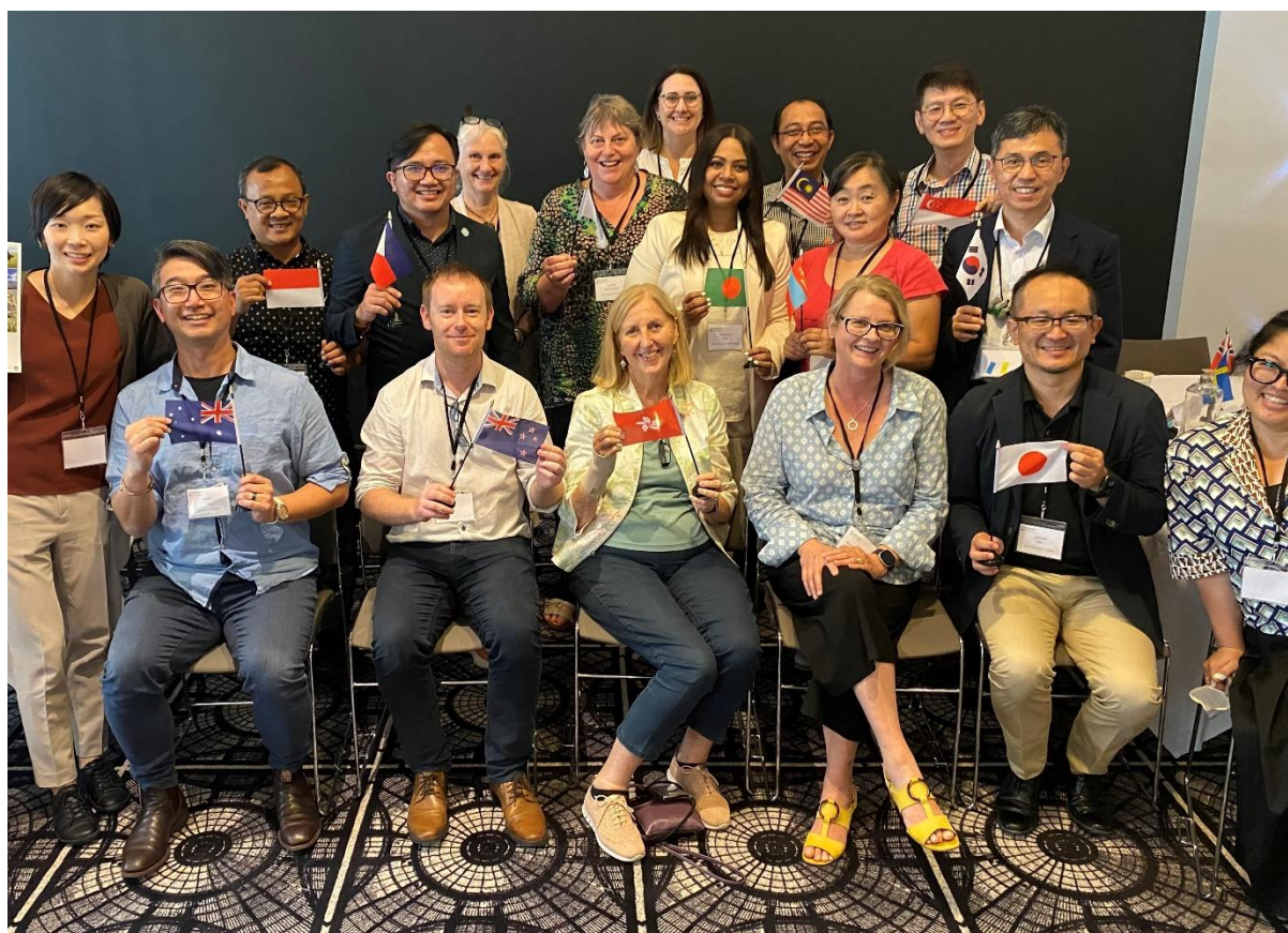
(ABOVE: The APOTRG General Assembly Meeting in Paris, France)

Of course, the APOTRG also had the opportunity to host its 8 th General Assembly Meeting, which was a fantastic opportunity for the various representatives from the Asia-Pacific regions to come together face-to-face and form deeper level connections at the human level. Especially since the Covid-19 pandemic had prevented this for extended periods since 2020.