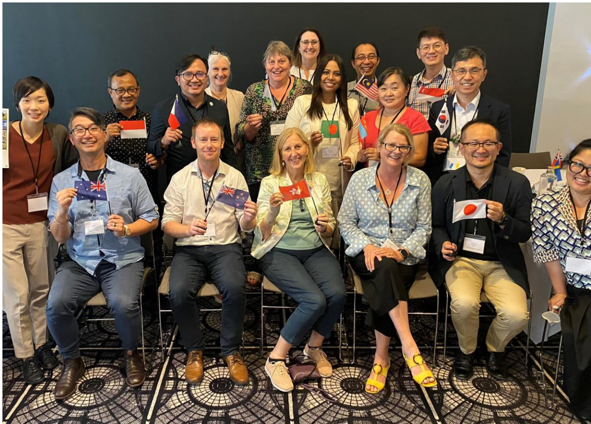
(Above: The APOTRG General Assembly in Paris, France, 2022)